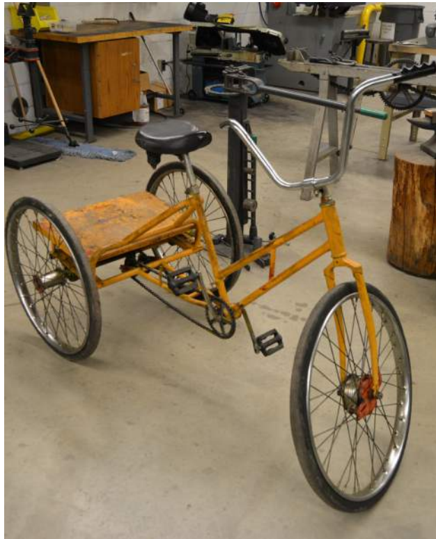
Tricycle before refurbishing/ cargo modifications