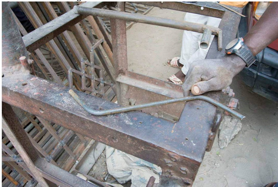
Jib Table at Msellems workshop in Zanzibar