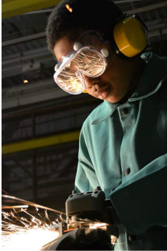
DCH student using angle grinder in Shop