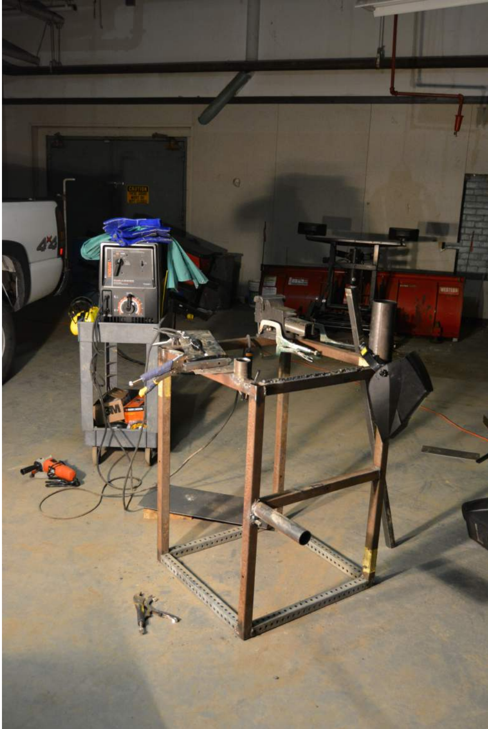
Project Ultima tools at DCH workshop Detroit.