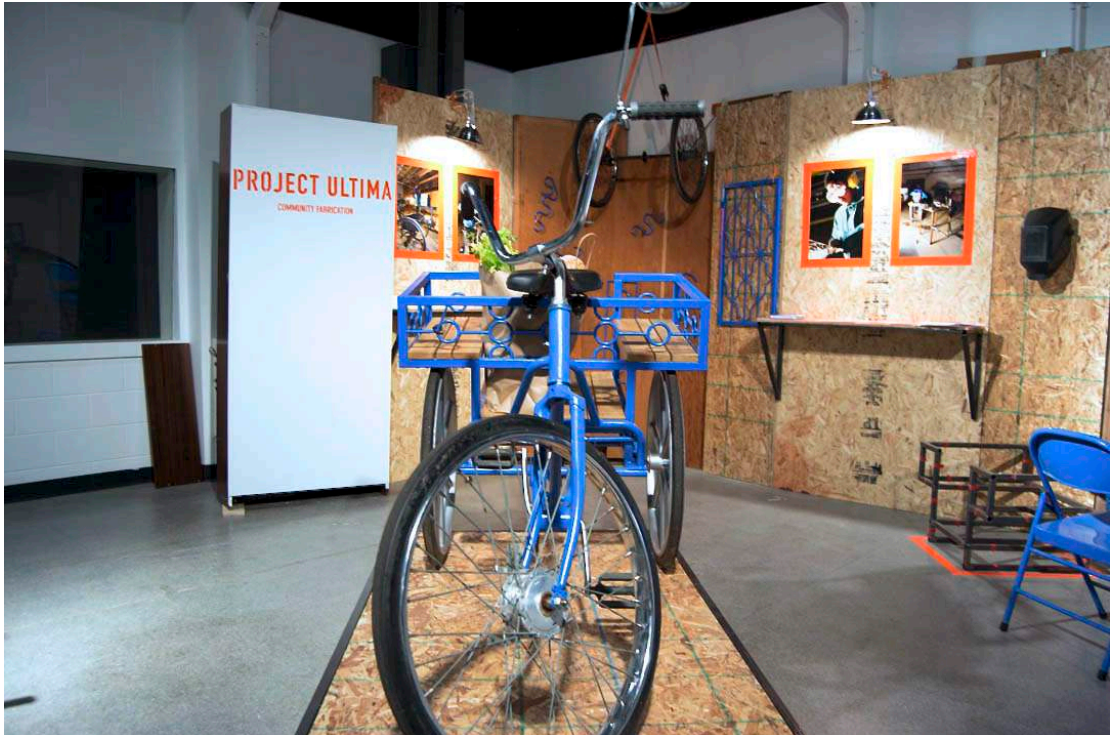
Picture of Project Ultima install for Senior Thesis Exhibition.