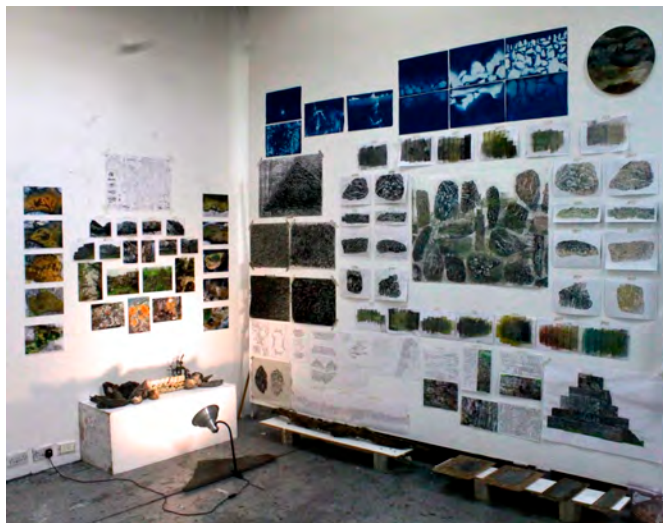
studio display – photographs, rubbings, drawings, collage, prints, painting

Through my study abroad experience in Ireland, I was able to discover the intimate proximity of the history that is literally buried beneath our feet. For the first time, geology became a platform for artistic expression, building upon my past interest in rock formations for their tactile and visual qualities. I discovered a way of seeing and engaging with my surroundings, a method of making and writing that I'd developed throughout my undergraduate education, now brought into a new level of clarity and focus. Even now, almost a year after my trip, the Burren has come to represent a lasting state of mind: one that considers every seemingly familiar experience as fresh and shining, alive and full of meaning.