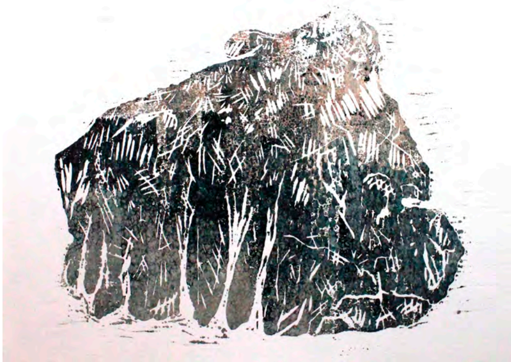
Rock III: Clyde; woodcut print, 9" x 12"