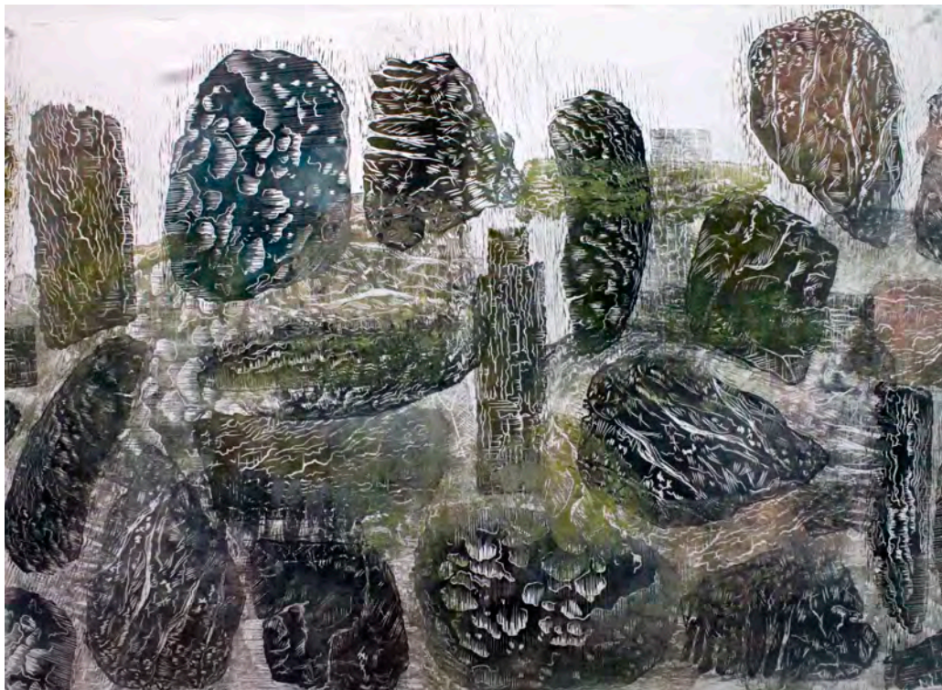
Stone Hedge, multi-block woodcut print on Rives BFK, 30" x 40"