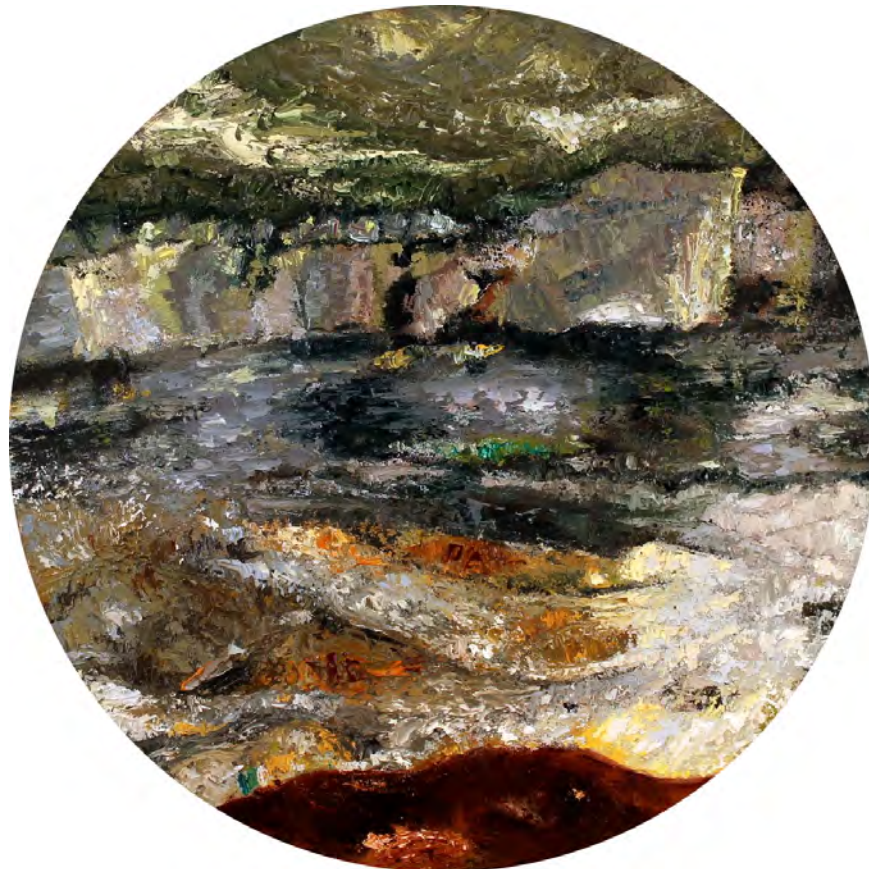
Bookmark , oil on canvas, 16" D