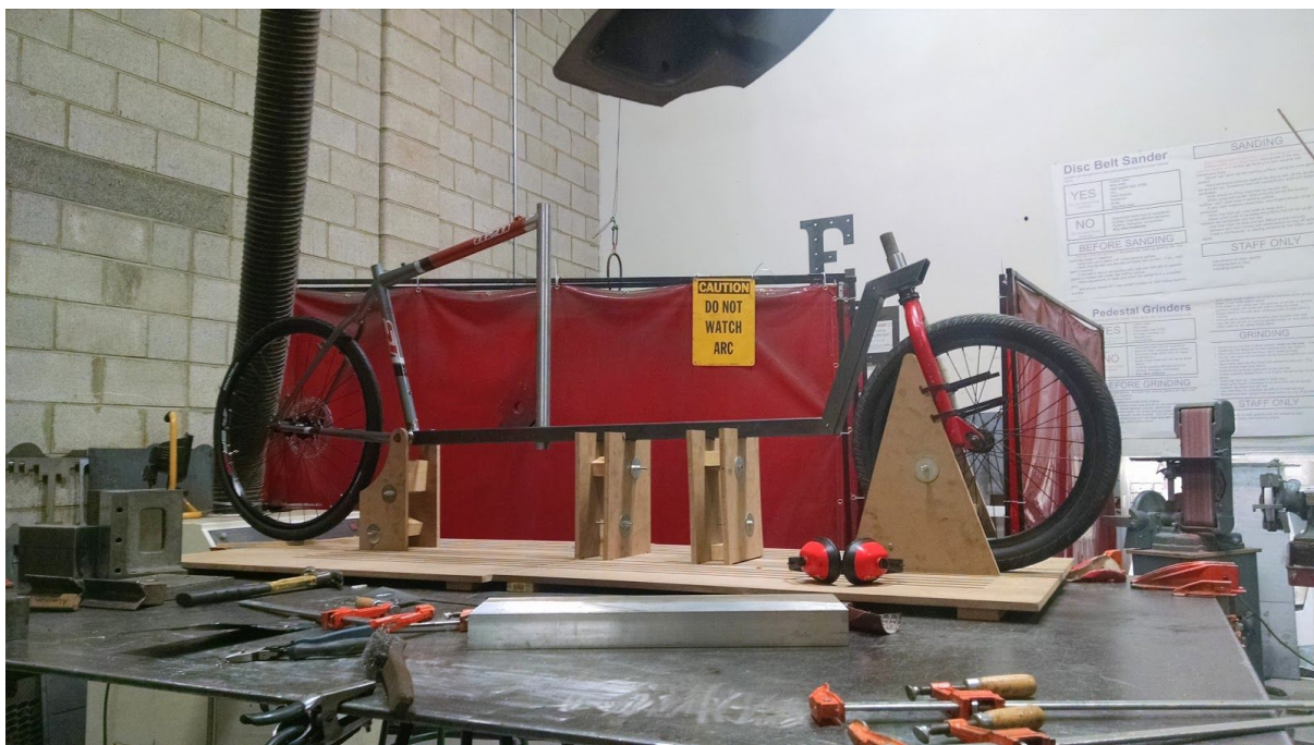
Photo 4: Early experimenting with jigs and bicycle frame building techniques.