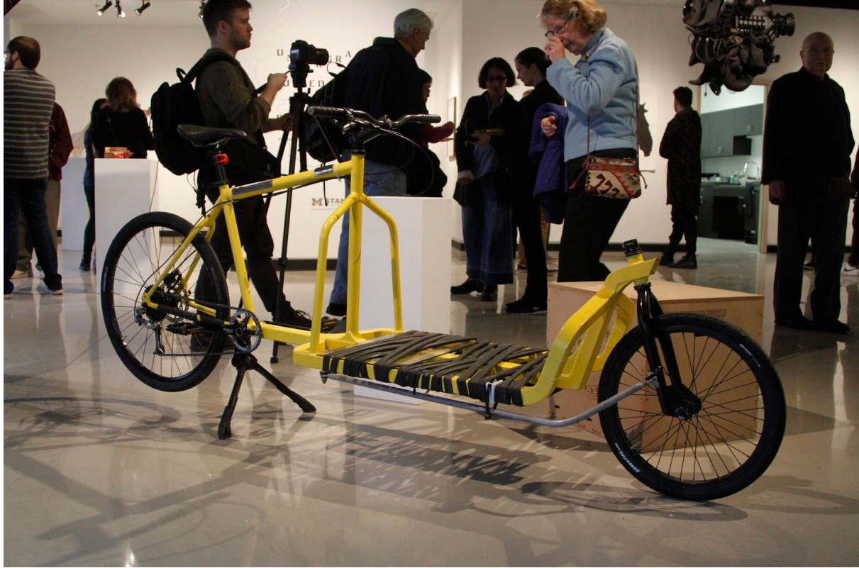
Photo 5: Final product at the Stamps School of Art and Design Undergraduate Juried Exhibition 2016.