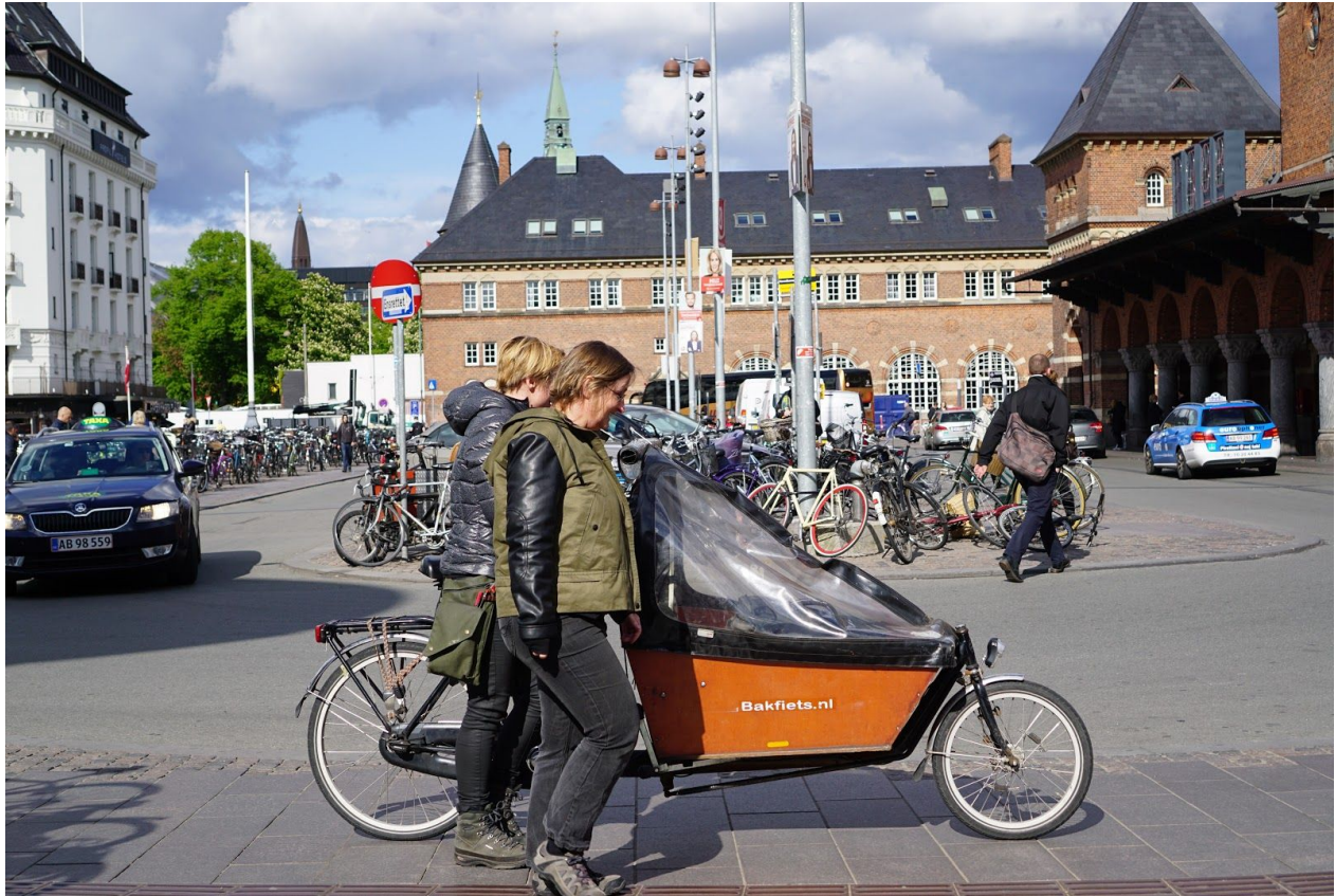
Photo 1: One (Long John) of many types of cargo bicycles found in Copenhagen.