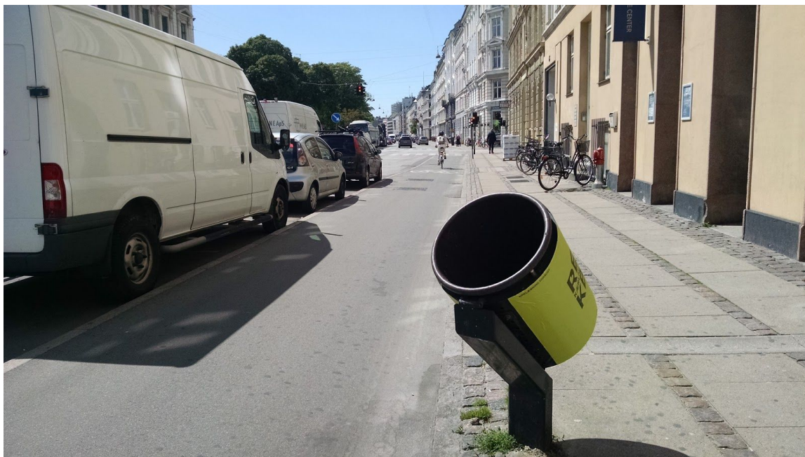
Photo 2: How much Denmark supports its commuters through its bicycle infrastructure. Everything from safe lane widths to designated traffic lights. In this photo, a trash can is tipped on an angle to allow cyclists to dispose of their trash while riding.